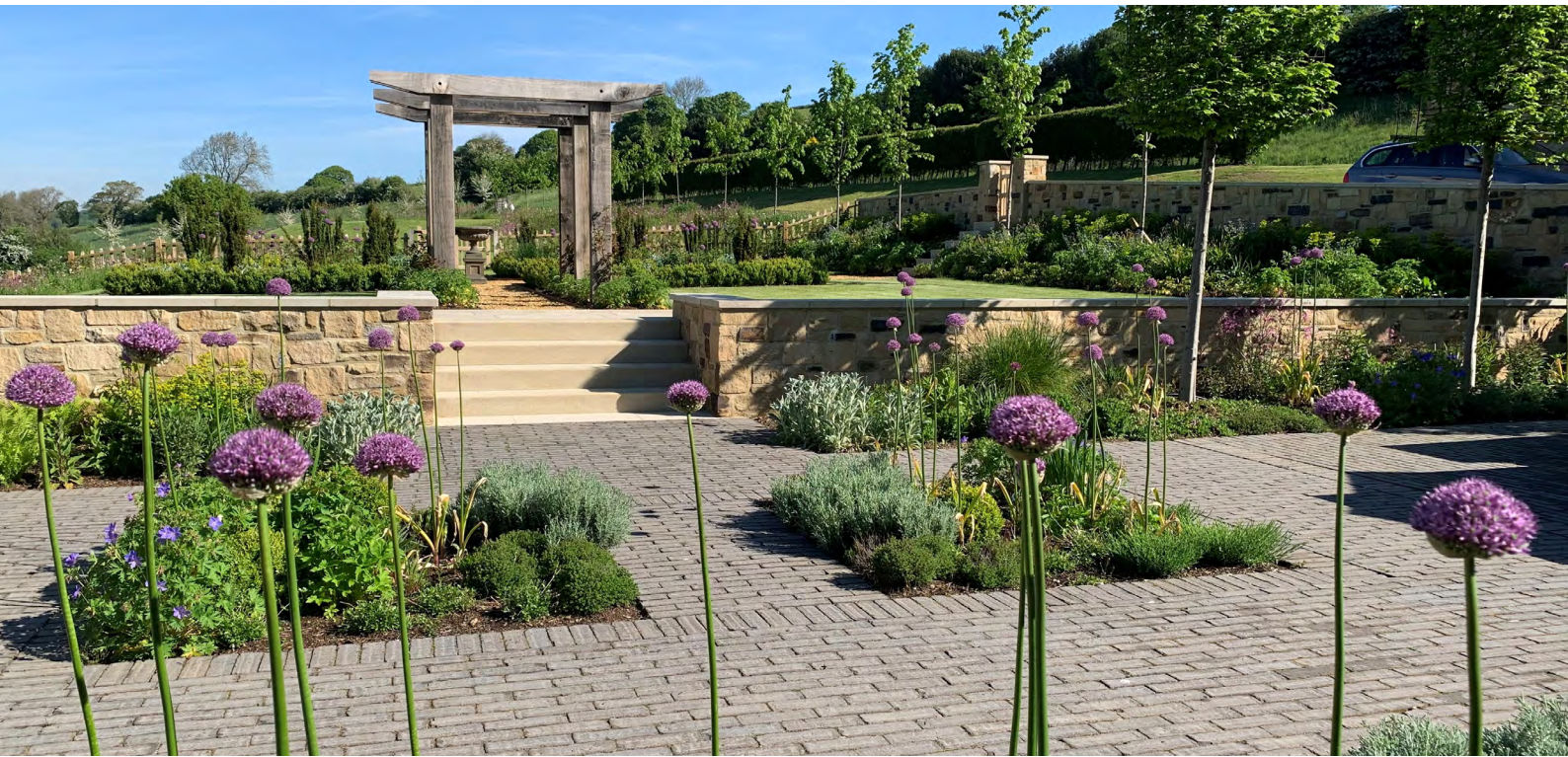
Peth Farm, Durham